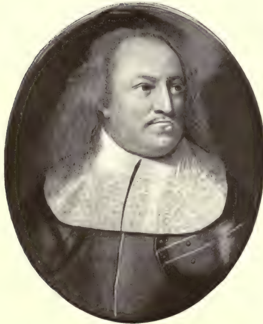
JOHN, EARL OF LOUDOUN (1598-1662) BY SAMUEL COOPER